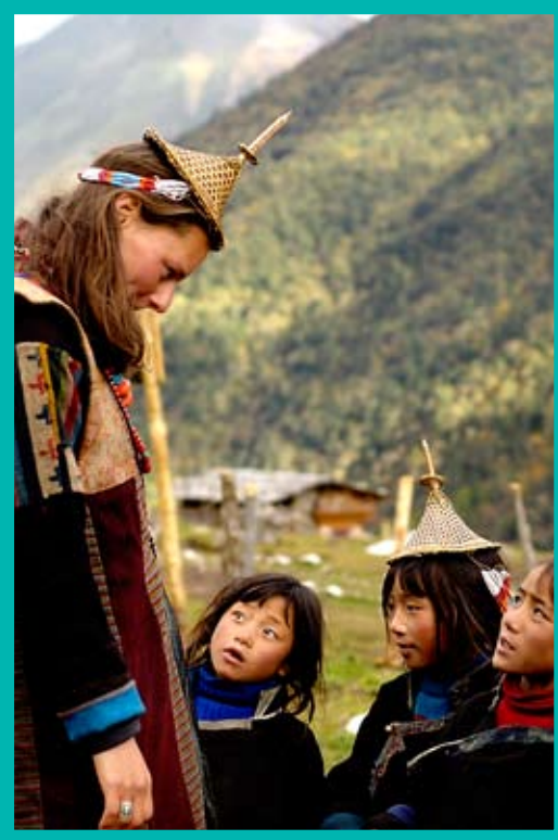
Layap girls admiring one of our guests

Bhutan is one of the most beautiful places on earth, with some of the world's grandest mountains and the most breath-taking landscapes. Over the years, we have experimented and perfected unique itineraries to enhance your experience. Itineraries that offer insights into Bhutan and what Bhutan means to the outside world; a chance to see our world in a whole new way.