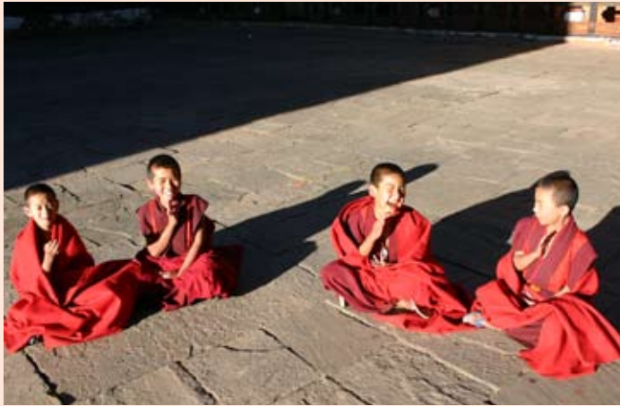
Young novice monks enjoying the afternoon sun, in the Paro dzong

Bhutan is one of the most isolated nations in the world; foreign influences and tourism are heavily regulated by the government to preserve its traditional Tibetan Buddhist culture. Most Bhutanese follow either the Drukpa Kagyu or the Nyingmapa school of Tibetan Buddhism. The official language is Dzongkha. Bhutan is often described as the last surviving refuge of traditional Himalayan Buddhist culture.